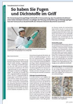
„So haben Sie Fugen und Dichtstoffe im Griff“