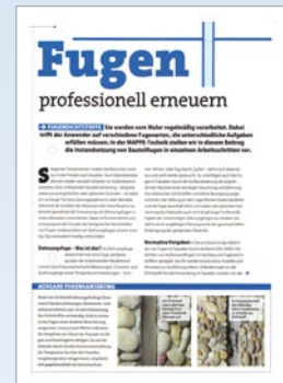
„Fugen professionell erneuern“