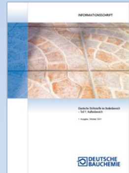
Information Script „Elastische Dichtstoffe im Außenbereich – Teil 1: Außenbereich“ (soon available in English)

» https://deutsche-bauchemie.de/publikationen/deutschsprachige-publikationen