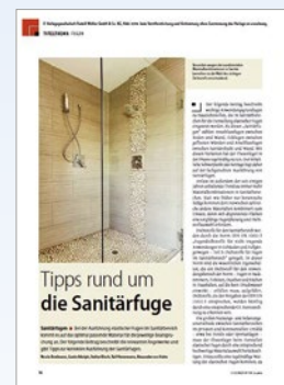
„Tipps rund um die Sanitärgefuge“