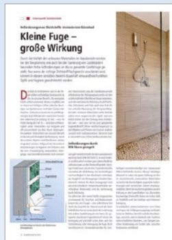
„Kleine Fuge, große Wirkung – Anforderungen an Dichtstoffe im modernen Gästebad“

The manifold fields of application for construction sealants are explored and the numerous special articles revised for publication in trade journals.