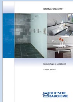
Information Script „Elastische Fugen im Sanitärbereich“ (only available in German)