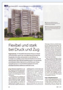
„Flexibel und stark bei Druck und Zug“