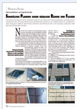
„Sorgfältige Planung gegen hässliche Ränder und Flecken“